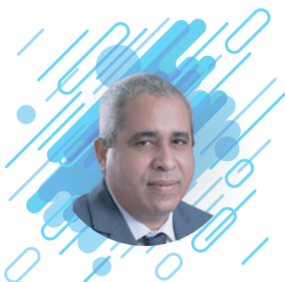
Pr Najib Al idrissi