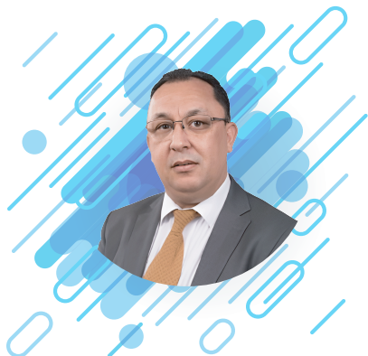
Pr Mustapha NAJIMI